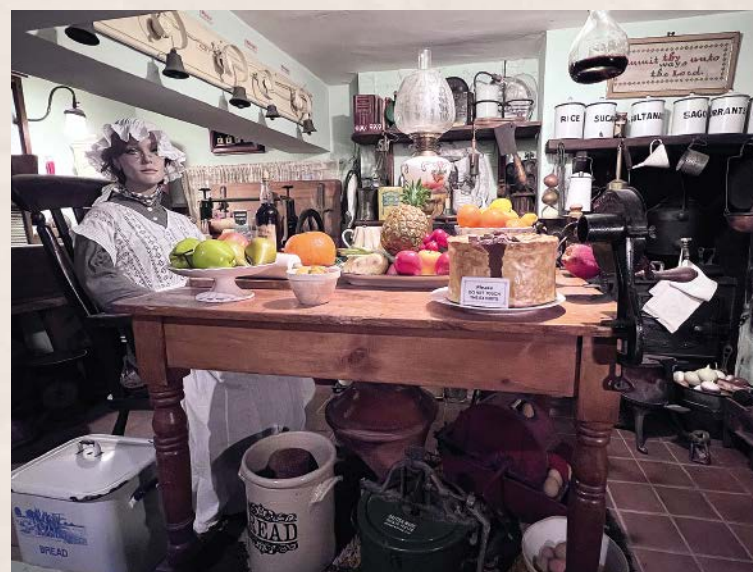
Period Rooms... Go back in time and peer into Victorian family homes and rooms. Discover what life was really like.