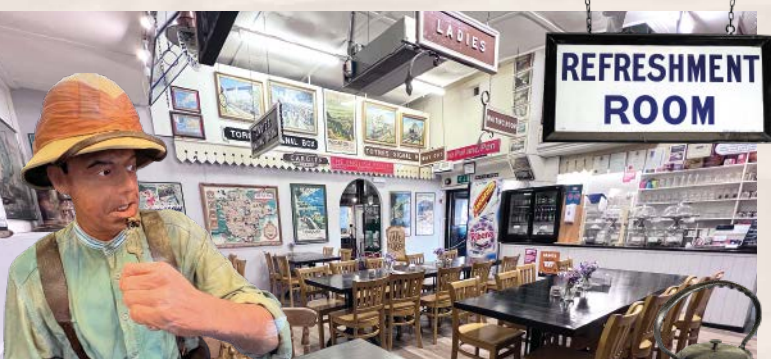
Café... Styled with original railway memorabilia, the Station Café serves a selection of hot and cold drinks, cakes and light bites.

Throughout 2022, there will be year-long Platinum Jubilee celebrations throughout the United Kingdom.