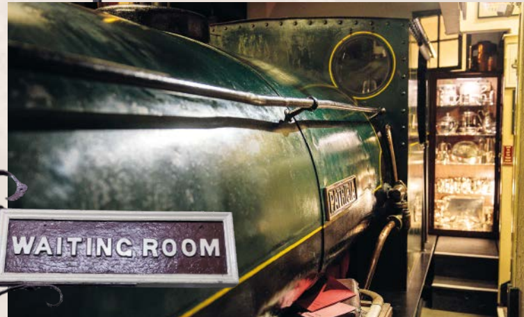
Steam Train... Visit our World War II evacuees at our genuine station display with a real 27-ton Steam Train.