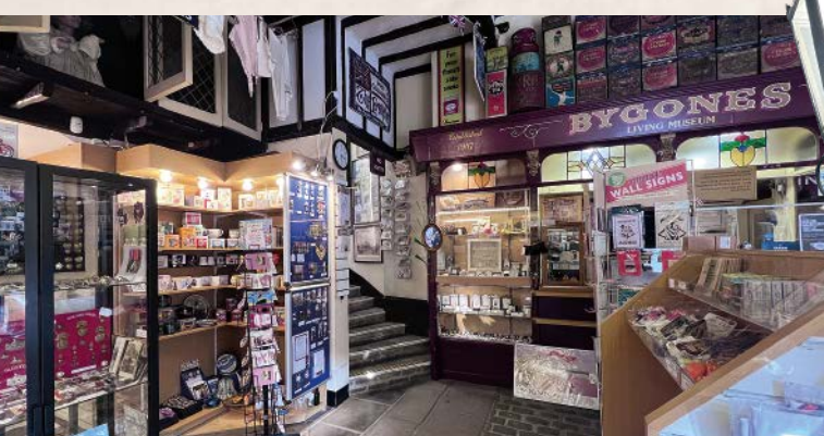
Gift Shop & Old Town Sweet Shop...

Where your journey begins and ends we have a delightful choice of confectionery and gifts to compliment your visit.