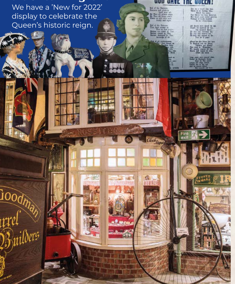
Victorian Street... Queen Victoria is waiting to greet you. See, smell and hear the bustle of a life size Victorian Street. Visit and explore the 15 shops and pub.

We have a 'New for 2022' display to celebrate the Queen's historic reign.