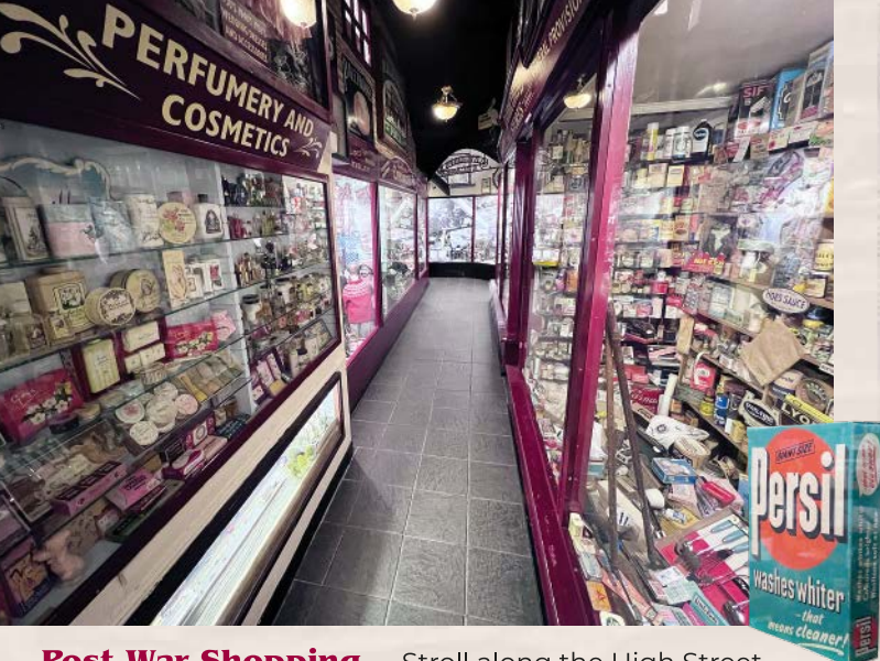
Post War Shopping... Stroll along the High Street to see the evolution of shopping as Britain recovers from the war. Spot well known brands of the past.