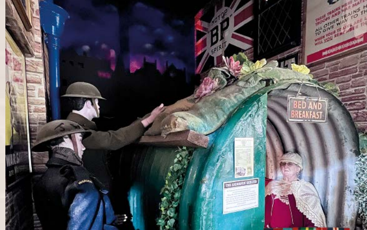
Wartime Britain... Walk through an immersive World War I trench and see a genuine World War II Anderson shelter.