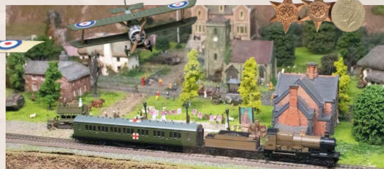
Model Railway... Big and little kids all love watching the model railway display. Respectfully designed to replicate scenes of World War I and II.